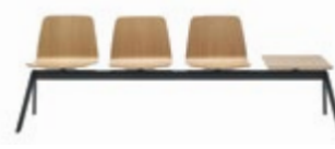
Bench VAR0750 - VAR0740 - VAR0730 - VAR0720 certificate+