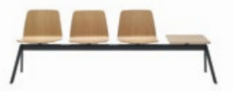
Banco VAR0750 - VAR0740 - VAR0730 - VAR0720 certificado+